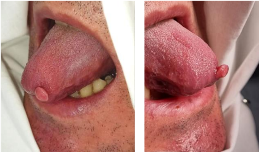
Fig. 1 Oral papilloma located on the dorsum of the lingual organ at the apex